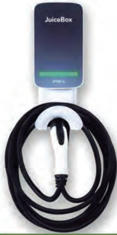
ELECTRIC VEHICLE CHARGERS